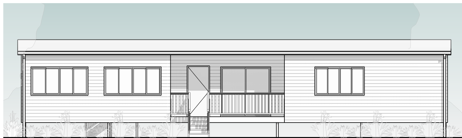
1 01 NORTH ELEVATION 1 : 100 @A3