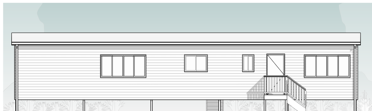
3 03 SOUTH ELEVATION 1 : 100 @A3