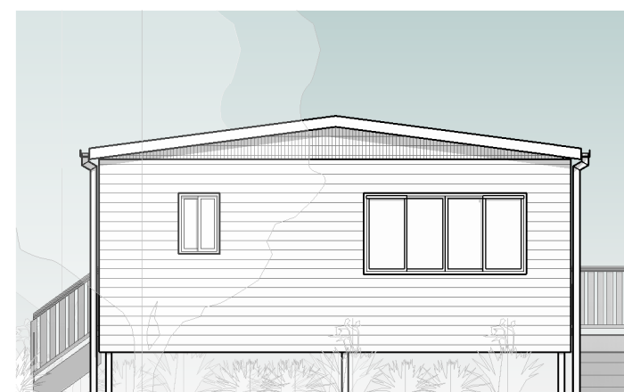
4 04 WEST ELEVATION 1 : 100 @A3