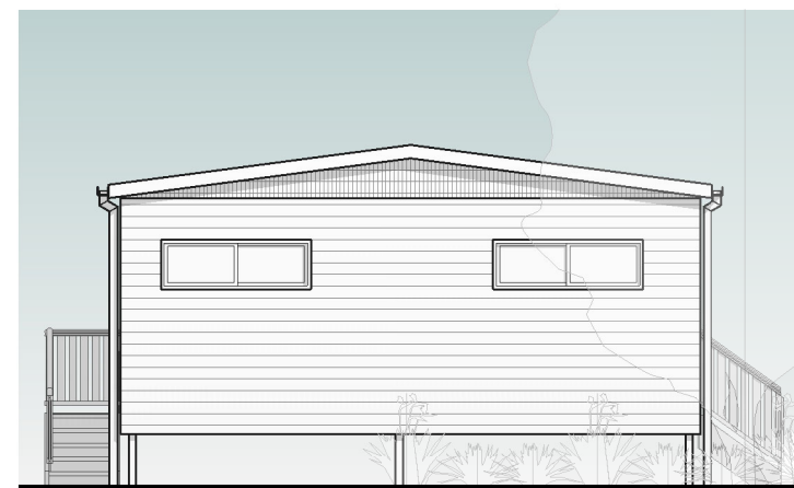
2 02 EAST ELEVATION 1 : 100 @A3